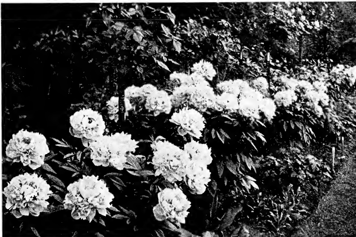
Baroness Schroeder, Royal Variety (See Page 7)

Having a large stock from which I send out only plants of my own growing, I can warrant the authenticity of the varieties. I have been most careful in purchasing stock from thoroughly reliable sources.